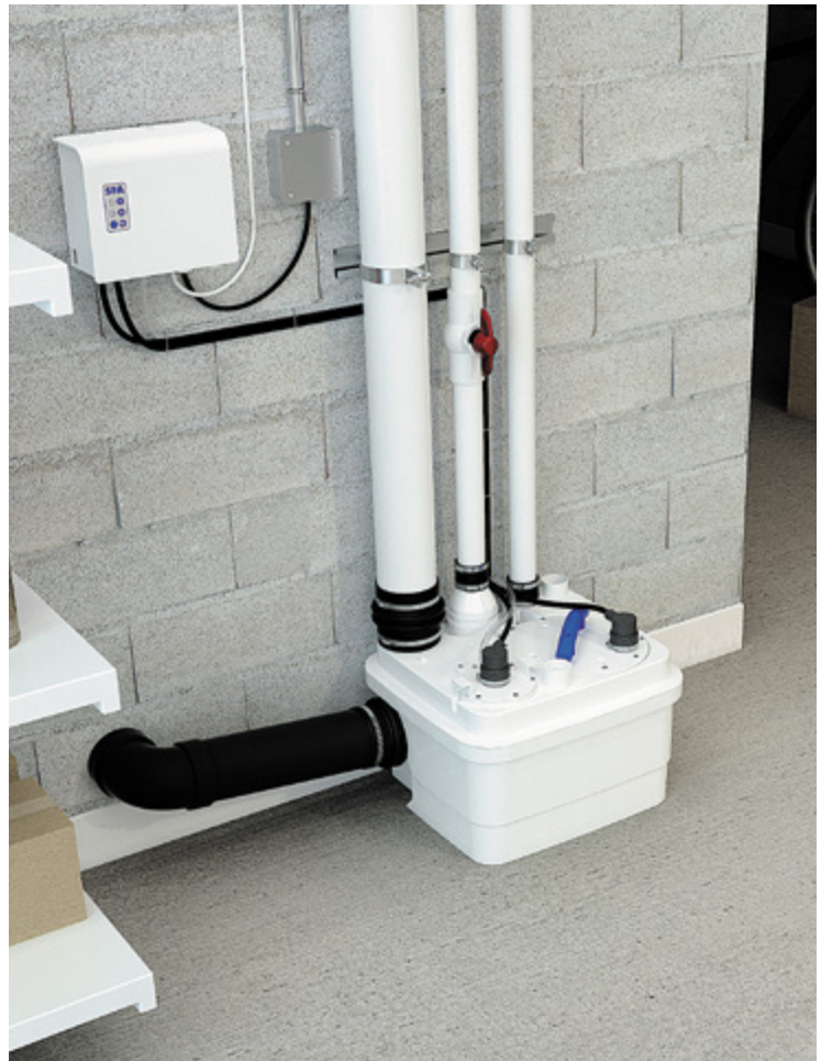
Installation above ground